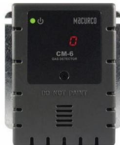
CO Sensor, Model CM-6