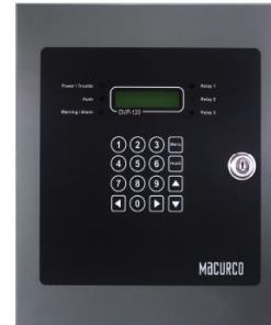
Controller, Model DVP-120 / DVP-120C/DVP-1200