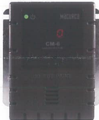
CO Sensor, Model CM-6