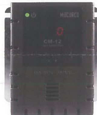
CO Sensor, Model CM-12