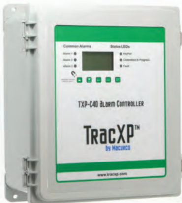
TXP-C40 Poly Enclosure