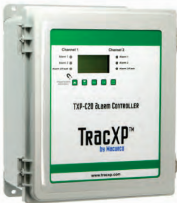
TXP-C20 Poly Enclosure

The TracXP C20 and TracXP C40 are versatile control panels that provide signal conditioning, display and alarm functions for up to four input channels. Both control panels come standard with two programmable relays. A large graphic LCD screen displays engineering units, 30-minute trends or bar-graphs. Status indicating Yellow and Red LED's provide highly visible real time alarm status and three adjustable alarm levels per channel. Versatile input options include 4-20 mA inputs or combinations of bridge (Catalytic Bead/IR) and toxic (Electrochemical) sensors. Output options include 4-20 mA, Modbus® RTU, dual Ethernet Modbus® TCP bridge, and additional relay outputs.