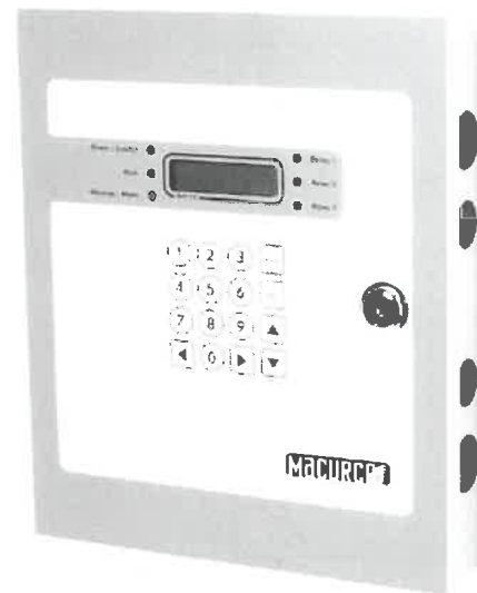
Controller, Model DVP-120