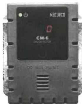
CO Sensor, Model CM-6