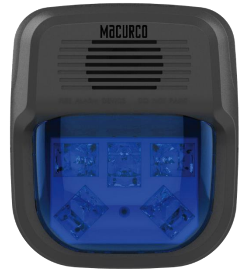
Macurco Horn and Strobe