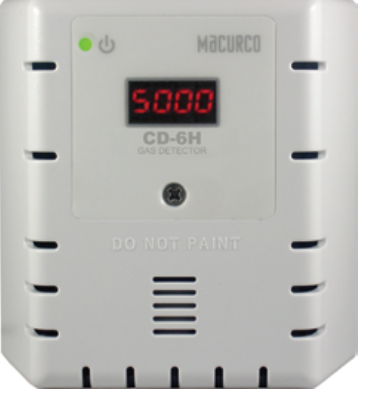
White Housing Option