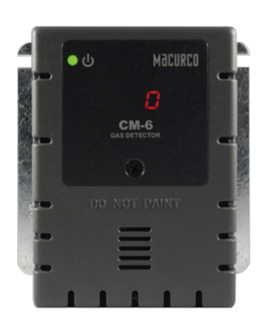
Grey Housing (Standard)